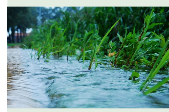
STORMWATER SPOTLIGHT | PAGE 2