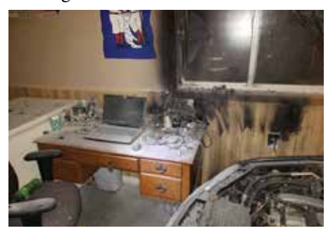
Space heater used in a garage.

Last winter the fire department responded to a couple of incidents involving accessory heating-related structure fires. It is not uncommon during colder months, but it does serve as an important reminder to use caution while utilizing accessory heating devices.