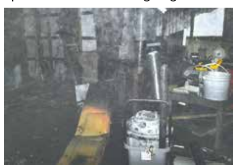
Woodburning stove not properly maintained.

Follow these safety guidelines when using alternative heat sources from FEMA on this page.