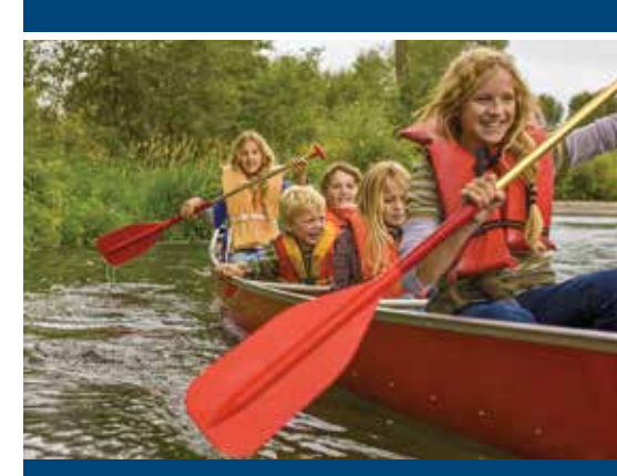
FALL ON THE RUM RIVER | PAGE 3