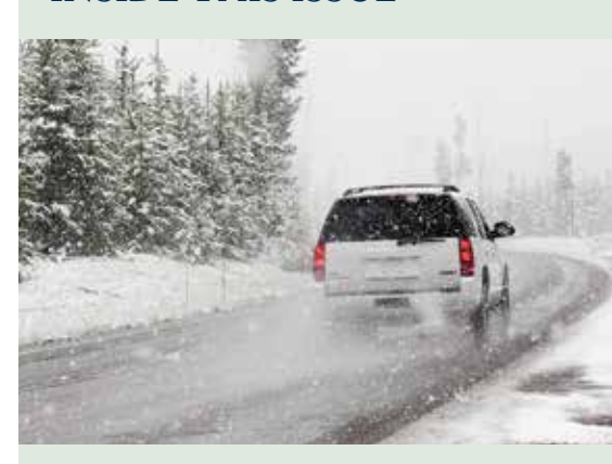
WINTER DRIVING TIPS | PAGE 2