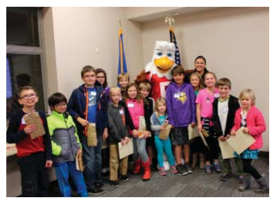
Watch for the spring newsletter for upcoming classes and come meet Eddie Eagle in person!

Eddie Eagle flew into this November's Gun Safety Class to help educate the children on being safe around guns.