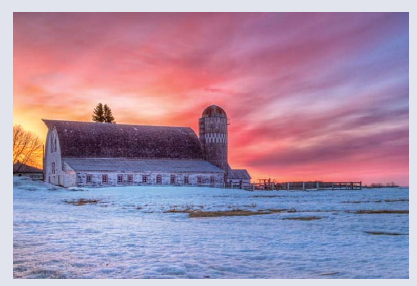
Thank you for your beautiful submission and to all those who entered.